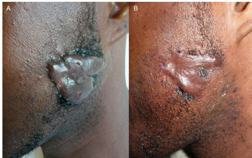
FIG. 2. Spontaneous keloid of the left cheek (A) before treatment, (B) after 25 sessions of ablative fractional laser combined with topical betamethasone.