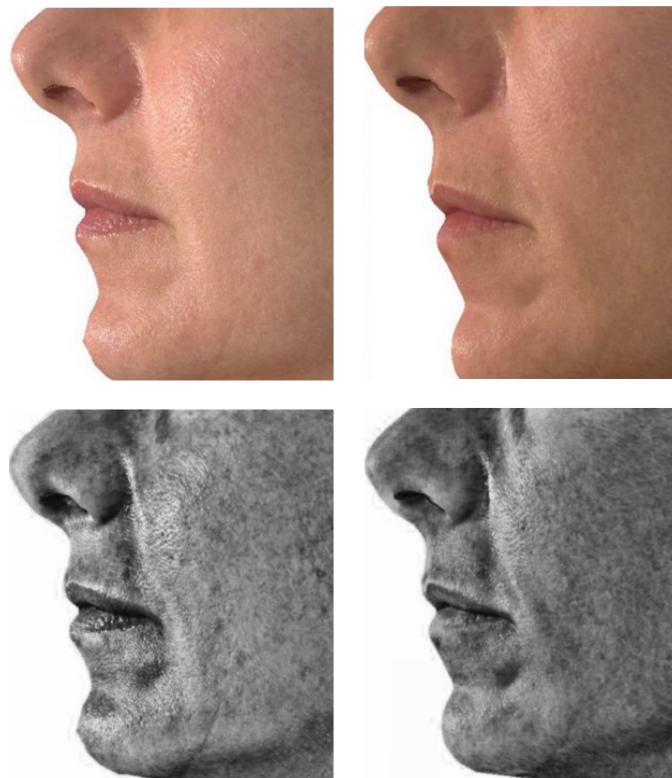
Figure 3: Baseline (A) and 12 months of ACCENT ULTRA (B) recorded with VECTRA 3D.