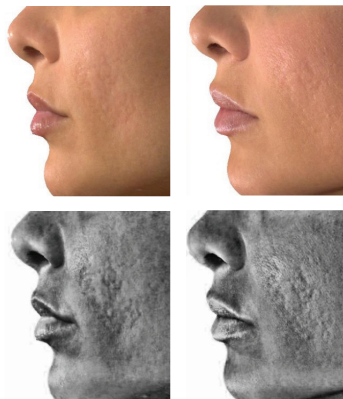
Figure 5: Baseline (A) and 12 months of ACCENT ULTRA (B) recorded with VECTRA 3D.