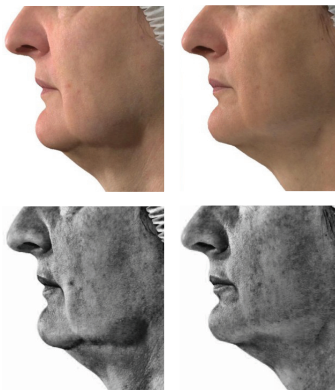
Figure 4: Baseline (A) and 12 months of ACCENT ULTRA (B) recorded with VECTRA 3D.