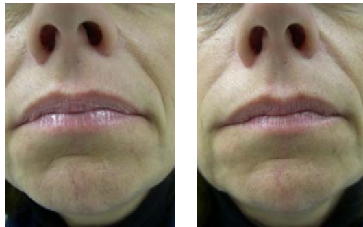
VL AFT 540nm Handpiece: Chin Telangiectasia. Before (left) and immediately after (right) a single treatment; >90% cleared up; skin type II; 18J/cm 2 ; 10msec pulse width.