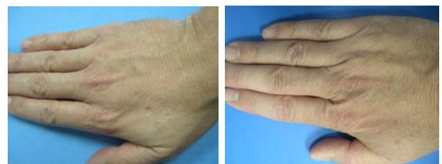
VL AFT 540nm Handpiece: Age spot. Before (left) and 3 weeks after (right) a single treatment; >90% cleared up; skin type III; 18J/cm 2 ; 12msec pulse width.