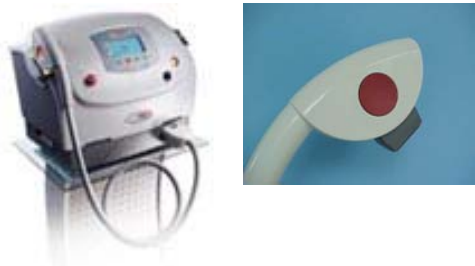
The Aria and AFT Handpiece

aperture into a glass light guide located on the handpiece tip. The pulse widths of all Aria AFT handpieces are preset according to clinical application and patient skin type. Each handpiece gives the operator the option of three pulse width sequences: